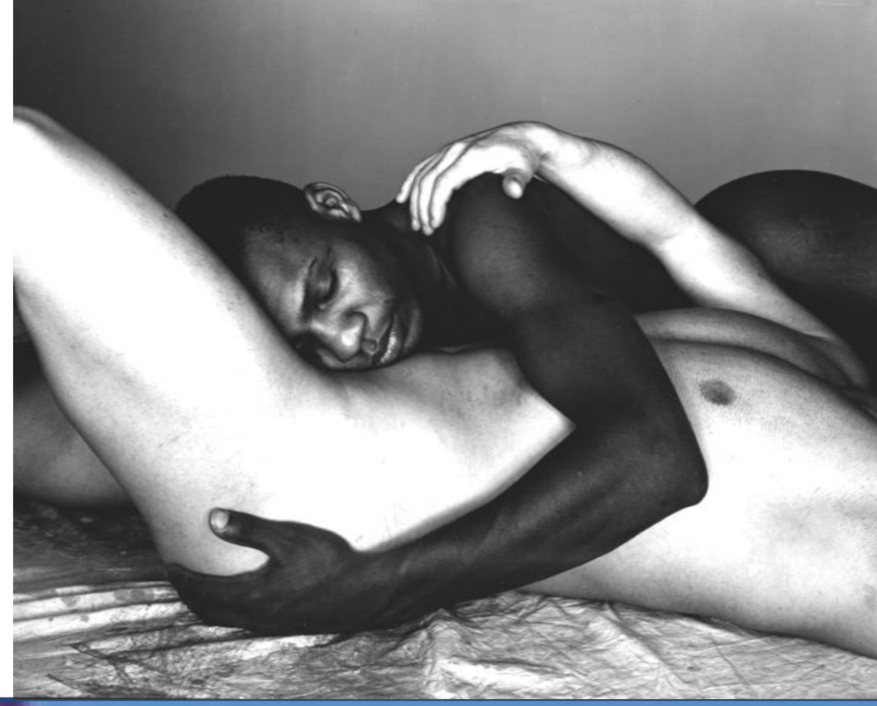
Man in His Element