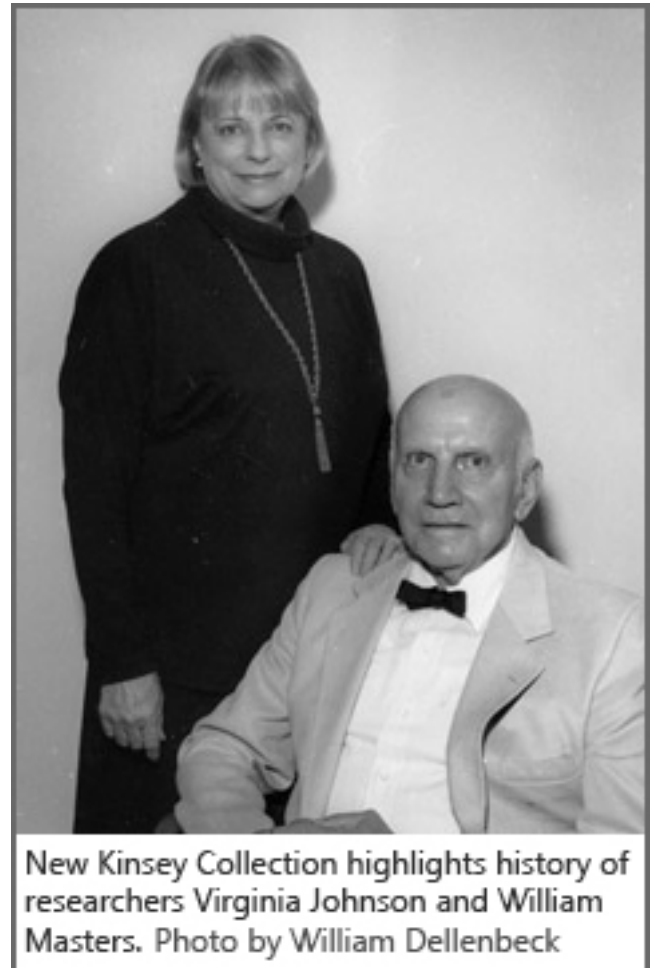
New Kinsey Collection highlights history of researchers Virginia Johnson and William Masters.