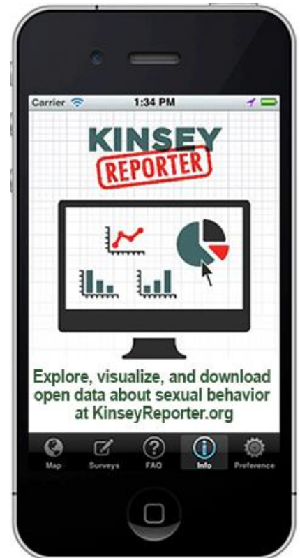
The Kinsey Reporter app is out and ready to use!

New In the Kinsey Library and Art Collections Donation highlights include Ex Libris, Japanese photos, and unique research archives.