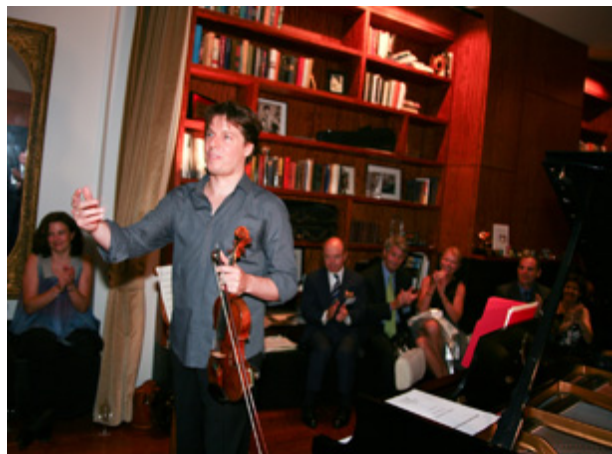
Violinist Joshua Bell addresses guests at a benefit for The Kinsey Institute in his New York City loft. Bell is an instructor at IU's Jacobs School of Music.