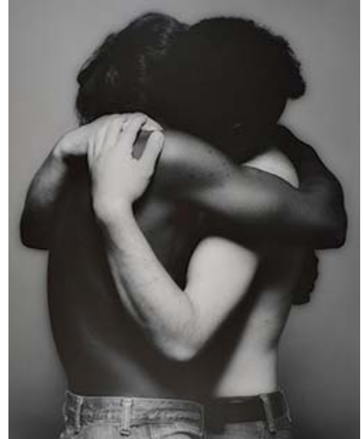
Embrace (1982)