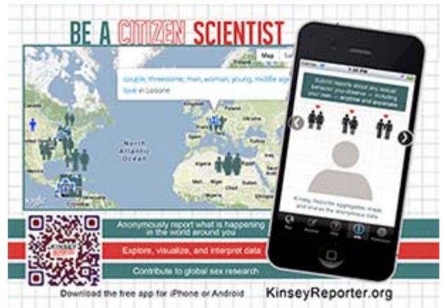
The Kinsey Reporter App is one tool that will aid in collecting information from students on sexual assault.