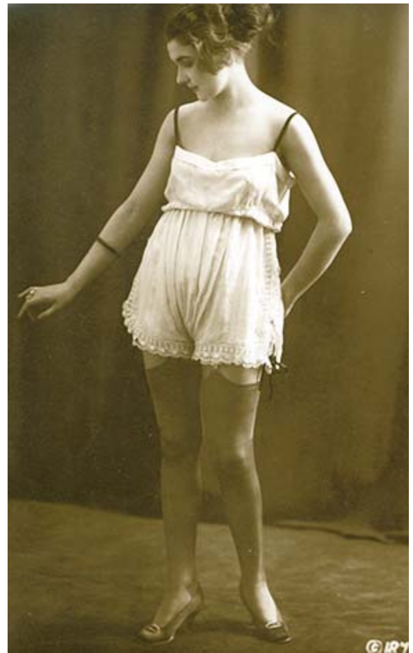
Anonymous photographer, France Woman in undergarment , c.1920 Photograph in postcard format

Both shows open on Friday, September 19, 4:30 to 7:00 pm at The Kinsey Institute Galleries, Morrison Hall, Indiana University.