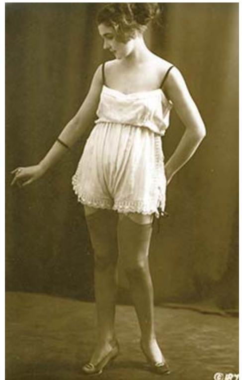
Anonymous photographer, France. Woman in undergarment, c.1920. Photograph in postcard format.

Visit our YouTube channel to watch our Opening Night and Artists Show & Tell videos.